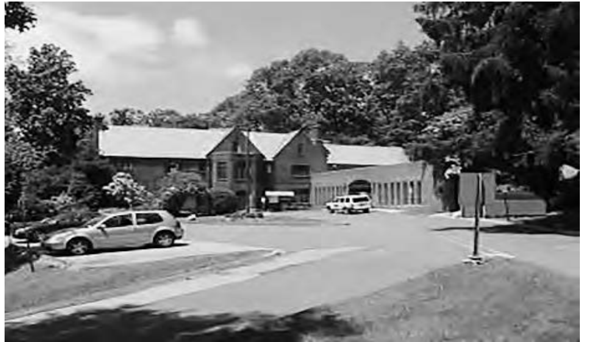
Office of Student Assistance