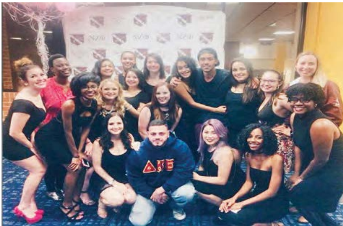
Think Pink Fashion Show 2017