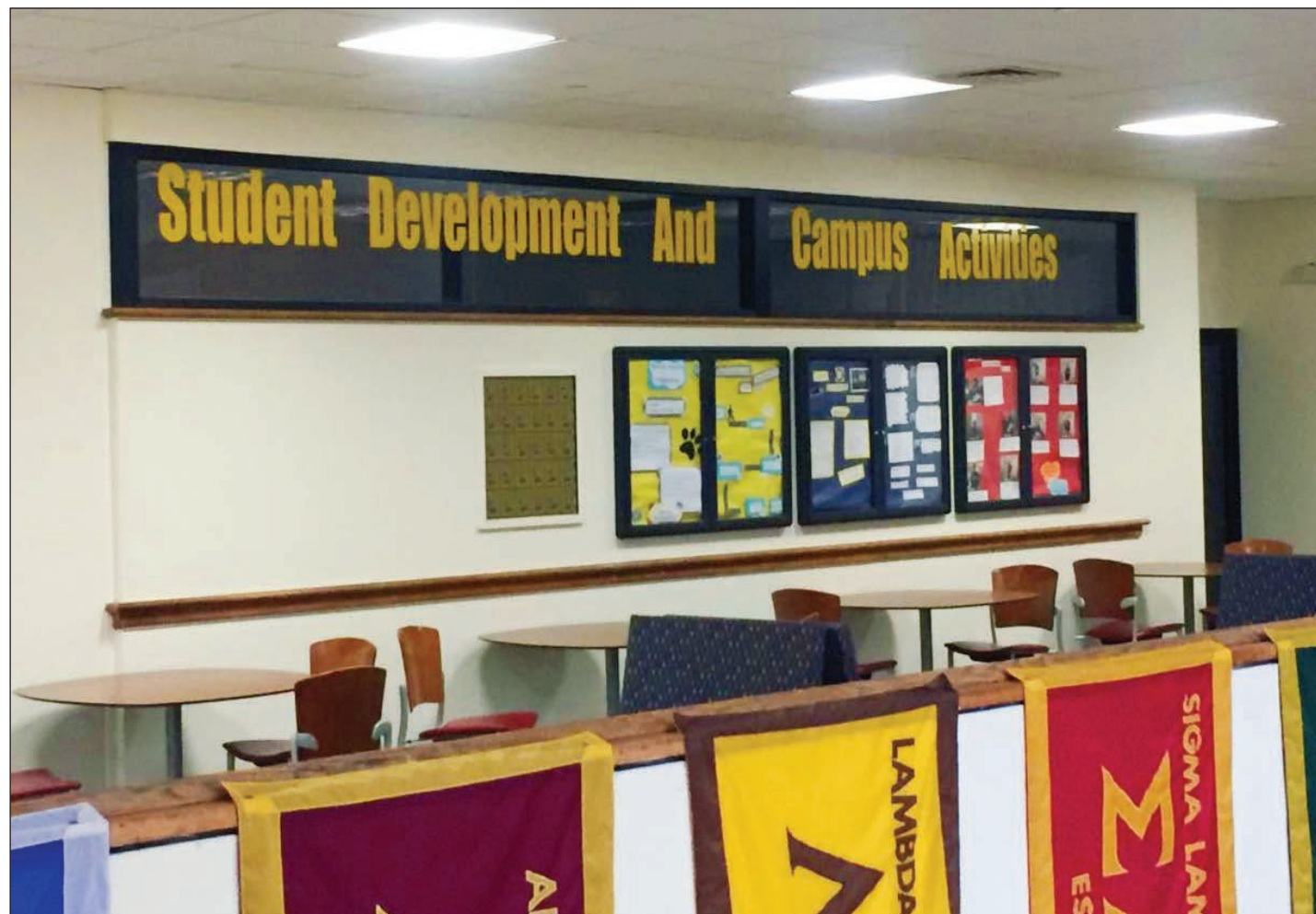
Student Development and Campus Activities opens its doors to help student get acquainted.

Financial Aid specializes in well... financial aid. That's where all the aid you receive from the school upon acceptance is calculated and evaluated. For any problems or questions about your financial aid package, that is the office to go to. OSA deals with registration, billing, and payment for anything Pace related; student records, transcripts and verification forms, and academic scheduling. A lot of trips will be