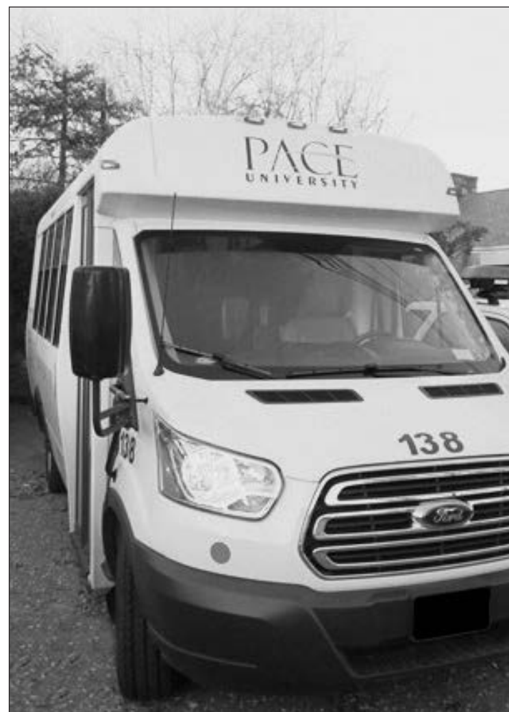
Pace offers shuttle buses that offers transportation for all students.

Unlike the New York City and Law School bus schedule, this bus makes more than a couple trips