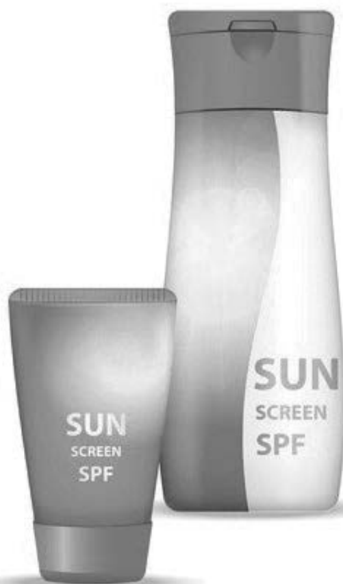
The sun is the number one reason for premature aging skin. Get into the habit of using sunscreen regularly.

Facial oils are now made in very light formulations that are good for layering and everyday use. Also, remember too much of anything is never a good idea. There's an oil for every skin issue!